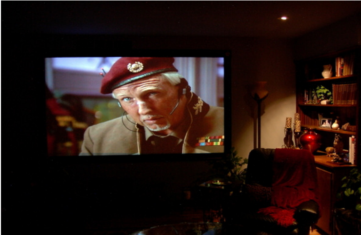
110" Light Fusion Family Room Theater w/DLP Projector