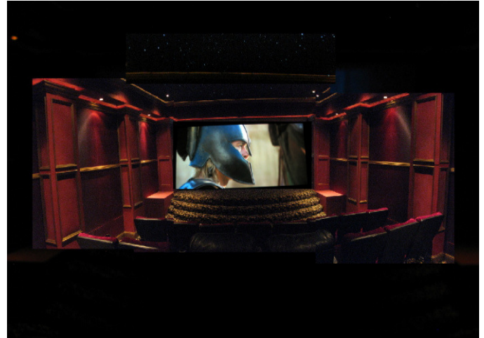
Bonus Room Theater w/110" Light Fusion w/LCD PJ