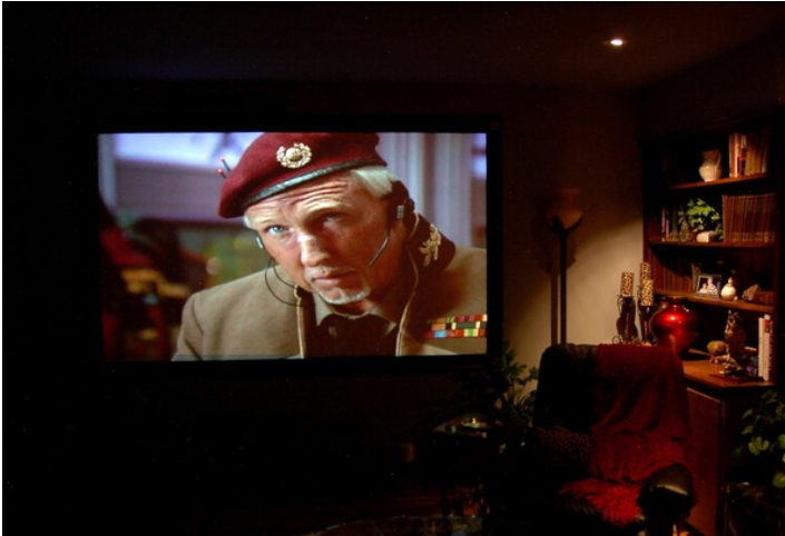
110" Family Room Theater