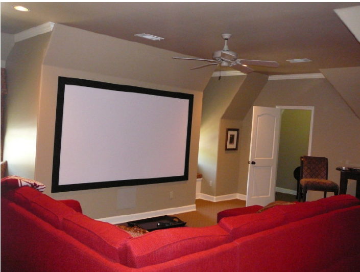
Bonus Room Theater w/110" Light Fusion