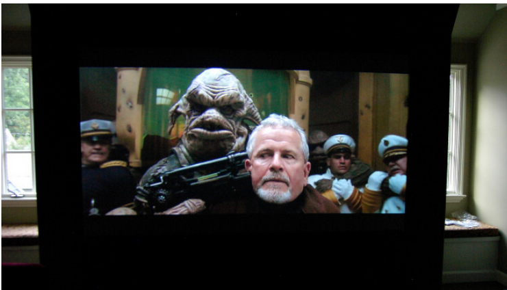
110" Light Fusion w/Sanyo 70-HD LCD Projector