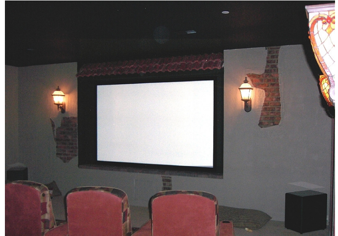
Mediterranean Theme Theater w/122" Light Fusion