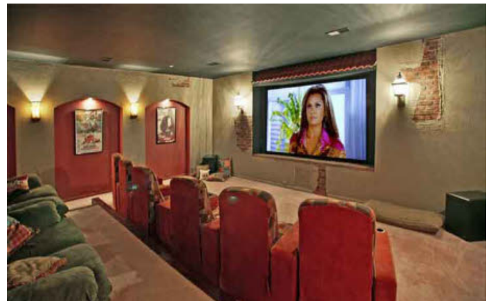
122" Black Flame Light Fusion w/Panasonic AX1000u 1080p Projector