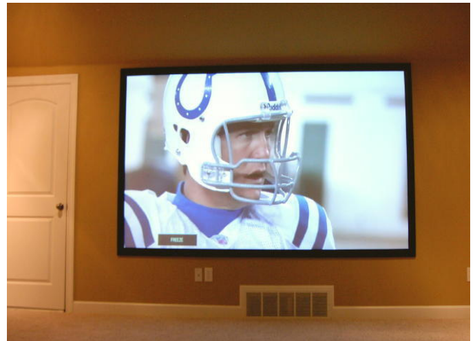
122" Black Flame Light Fusion - Panasonic AE100u