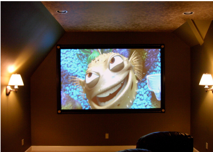
Bonus Room Theater w/110" Light Fusion w/DLP Projector